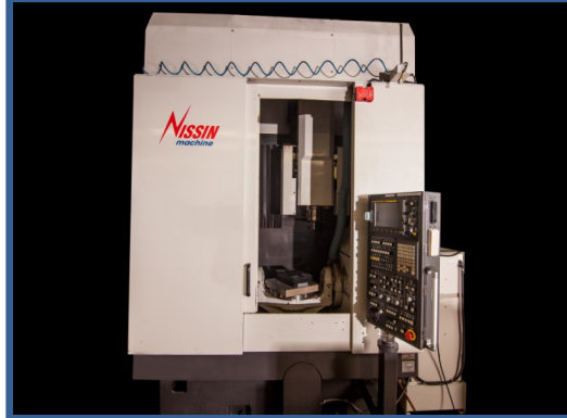
LA Gauge Company American Precision, At Its Best